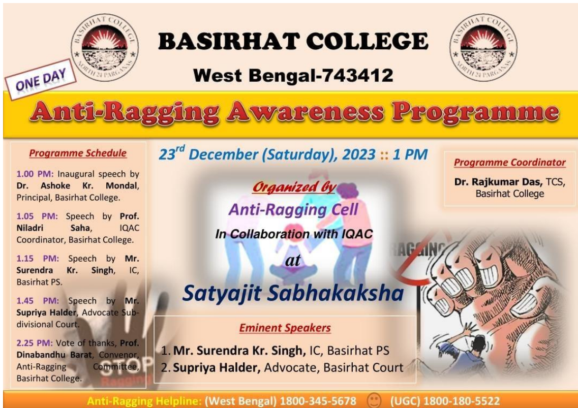
Pic 1. Flyer of Anti-ragging awareness programme