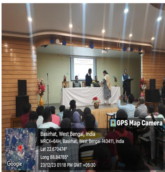
Pic 2. Felicitation of Honourable Principal, Basirhat College